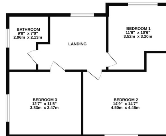
TOTAL FLOOR AREA: 1351 sq.ft. (125.5 sq.m.) approx.

Whilst every attempt has been made to ensure the accuracy of the floorplan contained here, measurements of doors, windows, rooms and any other items are approximate and no responsibility is taken for any error, omission or mis-statement. This plan is for illustrative purposes only and should be used as such by any prospective purchaser. The services, systems and appliances shown have not been tested and no guarantee as to their operability or efficiency can be given.